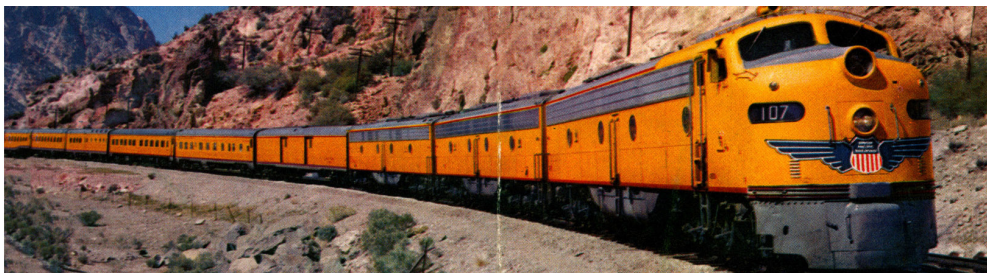
Union Pacific Railroad "Challenger Domeliner" pamphlet, 1955. William R. Hough Timetable Collection.

If you are not in Evanston or unable to come to campus, you can request for your items to be shipped to you. Requests for books are made in NUsearch, the library catalog. Some items may be unavailable for checkout; please contact us or Circulation to check the status of these items: circulation@northwestern.edu .