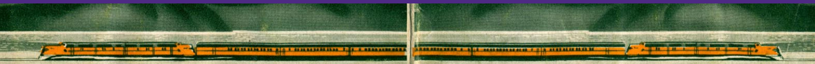
Chicago & North Western Line.