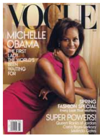
Library users can now search and browse the entire historical contents of American Vogue magazine in "The Vogue Archive," a joint venture of ProQuest and Condé Nast.

offers users access to the digitized contents of American Vogue magazine back to the first issue in 1892. Subscriptions to databases like this one give Northwestern scholars the ability to search huge image and text repositories, moving through the history and geography of fashion with the click of a mouse.