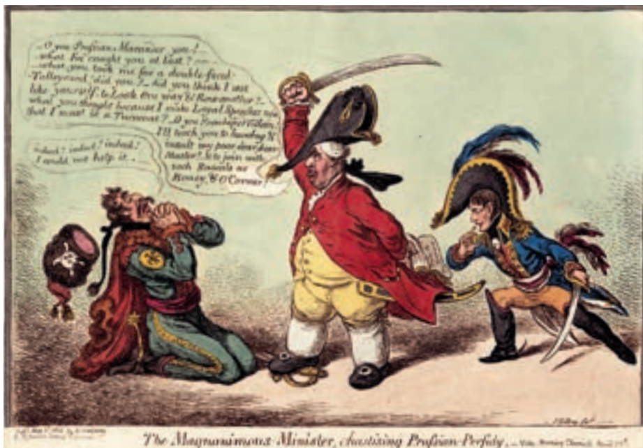
The Magnanimous Minister, James Gillray, 1806