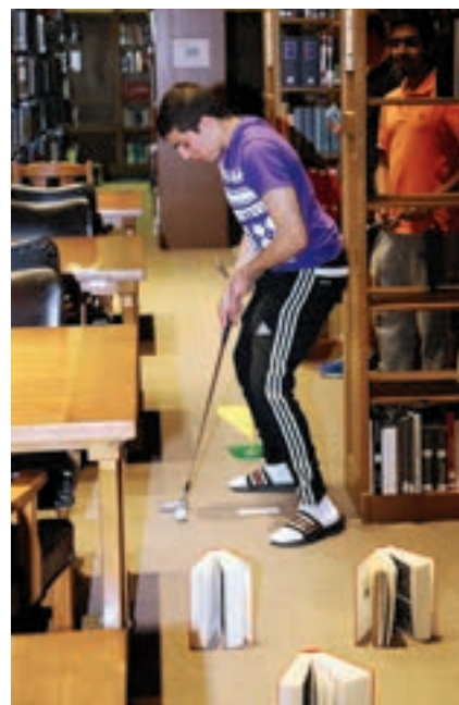
Above Atypical hazards in the Library's miniature golf course played havoc with many students' handicap ratings during the annual Deering After Dark.