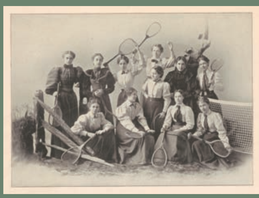
Entre Nous women's tennis club at Northwestern, circa 1896

To get a free catalog of the exhibition, visit libraries.nu/150catalog.